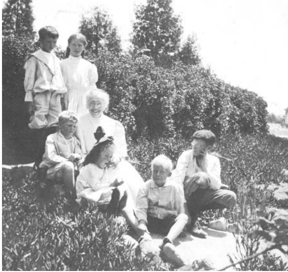
Generations of the Bixby family have helped to support the mission and vision of Rancho Los Cerritos

If you have been inspired by the role Rancho Los Cerritos plays in your life – or the lives of countless children and visitors to this valuable community asset – we ask that you consider including the Rancho in your estate planned giving decisions.